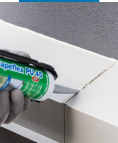
Flexible sealing of construction joints