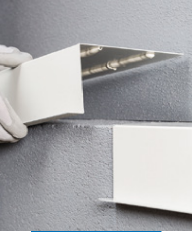
Flexible bonding of construction members and features

When bonding sections with a restricted surface area or weight, extrude single drops of the product on the back of the section and press it well down onto the substrate to